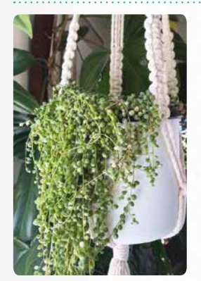
1. This method is great for trailing plants like String of Turtles, String of Pearls and Chain of Hearts.