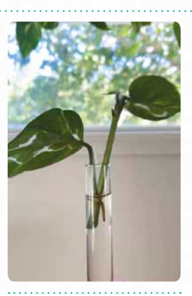
Cut between the nodes and fill a glass with water. Place your cutting in water, ensuring that the node is submerged.