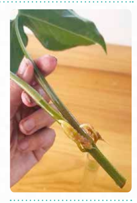
4. Within a couple of weeks (or months) you'll notice that the roots are starting to grow. When they're 1-2 inches long they're ready to plant!

You can find more indoor plant inspiration on Instagram ③@tuigardenandhome and make sure you give Hollie a follow @hollielovesplants!