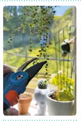
Take cuttings of the plant after at least five leaves. Take as many cuttings as you like (the more the better).