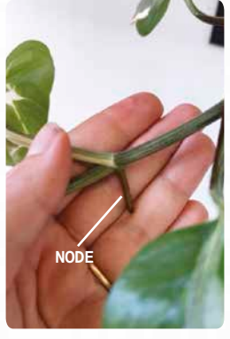
2. Every cutting will need a node. They aren't always easy to spot, so look for these small bumps as shown in the photo above.