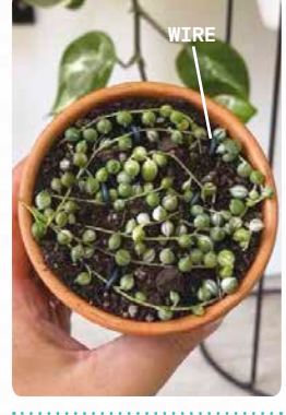
4. Place the cuttings on top of the soil and place wire cut and bent into U shapes to hold the strands down and help them establish.