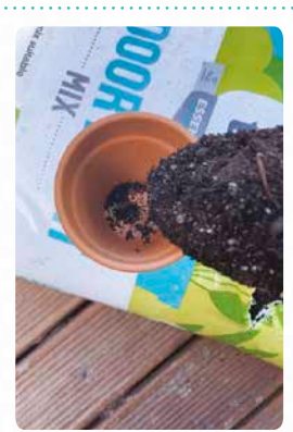
You'll need a small pot and Tui Indoor Plant Mix. Fill the pot with mix right to the brim.